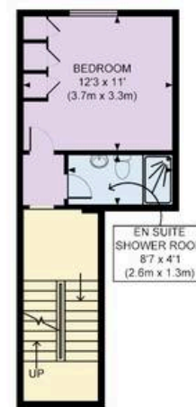
BEDROOM HALF LANDING LEVEL