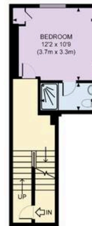
HALF LANDING ENTRANCE LEVEL PLAN