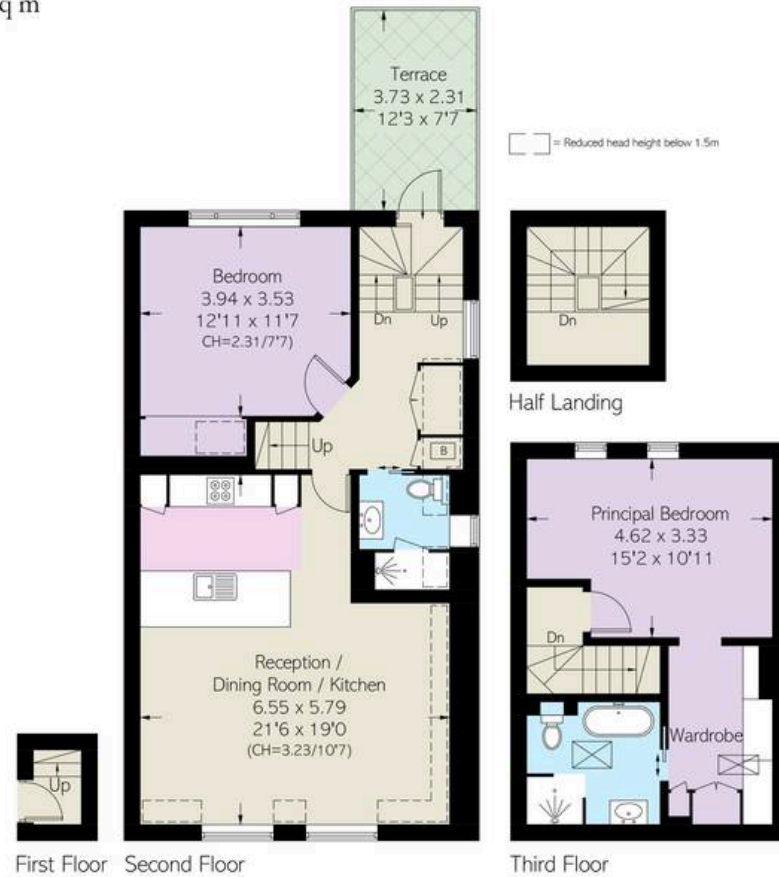
First Floor Second Floor