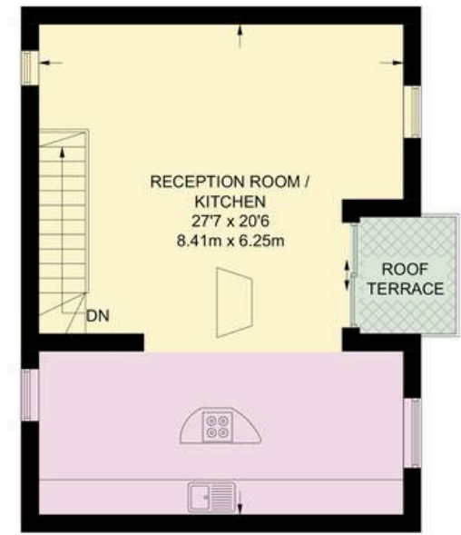
TOP FLOOR 538 Sq. Ft. 50.0 Sq. M.