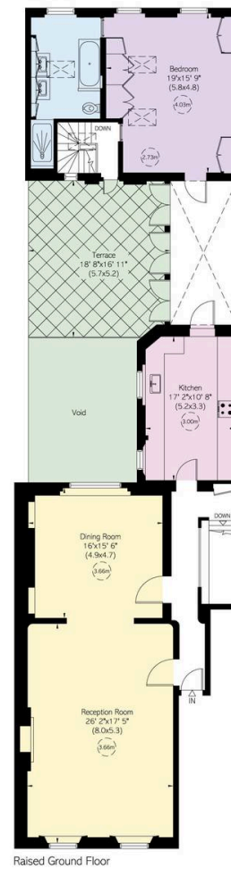
Raised Ground Floor