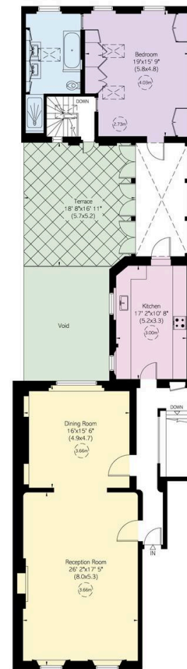
Raised Ground Floor