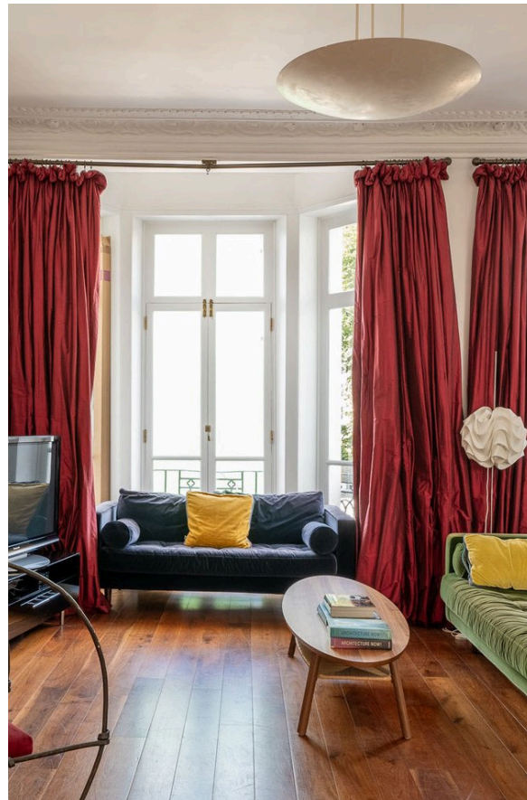
Upstairs Reception Room