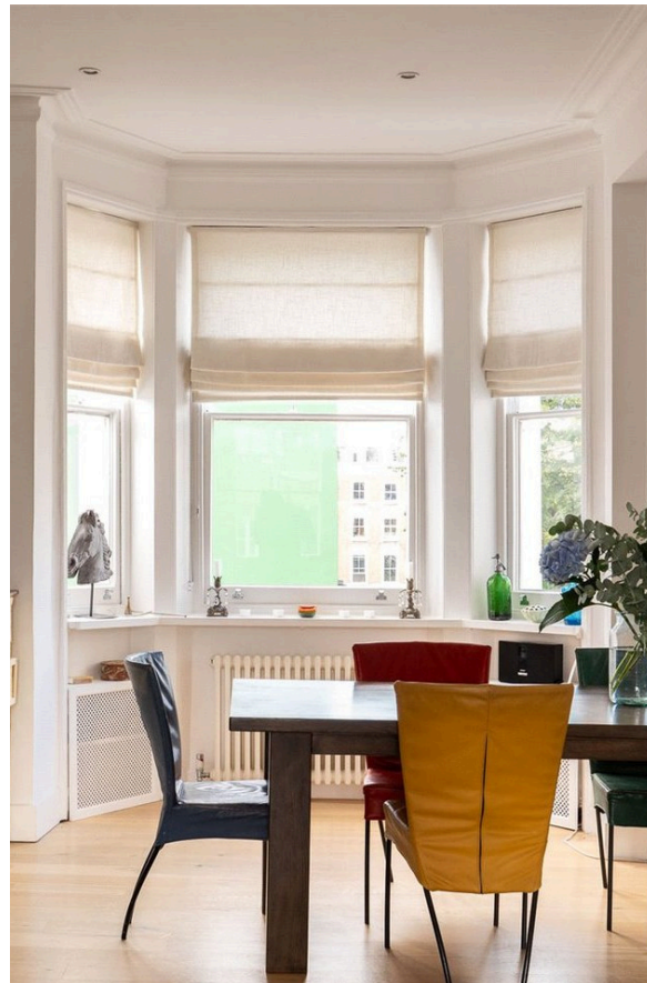
Upstairs Reception Room