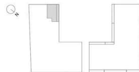
Coe House 1st Floor

Plans are not to scale. Measurements are approximate.